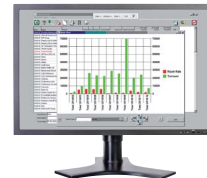
The event forecast gives you quickly a single view of your organisation and situation – keep control over your business performance.