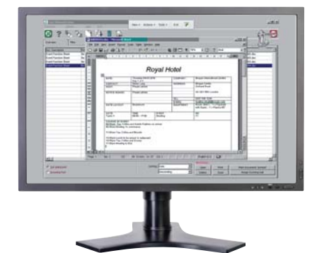
Correspondence system with MS Word integration. Service faster while exporting function sheets by just a few mouse clicks.