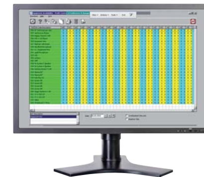
Equipment availability at a glance. Adapt faster.

And you can do all this and more, safe in the knowledge that you've got a solution that's both scalable and secure wherever you are. Just as you would expect from a world-leading technology provider with a local touch.